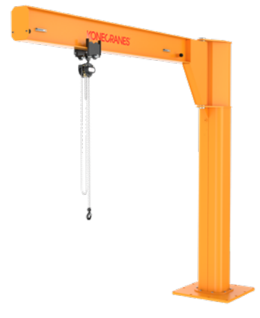
Underbraced I-beam with a manual chain hoist.