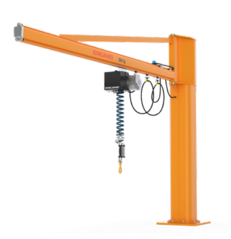
Overbraced, pillar mounted Konecranes KBK steel profile with an ATB AirBalancer.