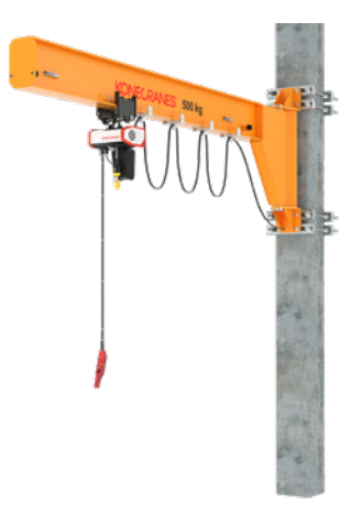
Underbraced, wall-mounted, I-beam with a Konecranes C-series electric chain hoist.