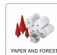
PAPER AND FOREST