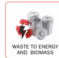
WASTE TO ENERGY AND BIOMASS